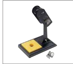
Iron holder for FX-8803