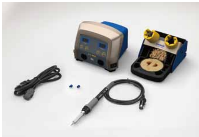
Station, Handpiece (FX-8801), Iron holder (with cleaning sponge, cleaning wire, rubber plate), Color band (qty 2), Power cord, Instruction manual