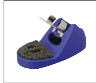
Iron holder for FX-8804