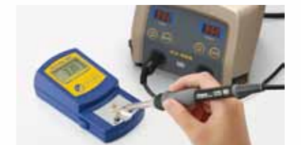
Photo Measuring the tip temperature with a tip thermometer HAKKO FG-100.

* Adjust the tip temperature to match the set temperature in case that there is a difference between those temperatures due to tip shape, heater replacement, or other factors.